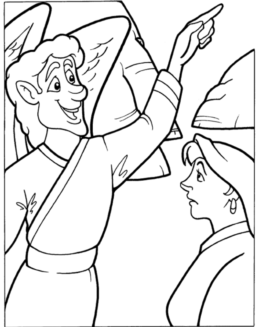
"He is not here, he is risen!"