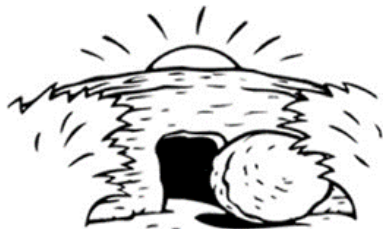
"He has risen! He is not here." Mark 16:6

Dear God, we thank You that Jesus, our Saviour, is not in a grave. He is alive! We serve a risen Saviour! Hallelujah! In Jesus' name, amen.