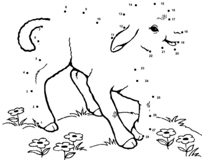
"I am the good shepherd; I know my sheep and my sheep know me." John 10:14